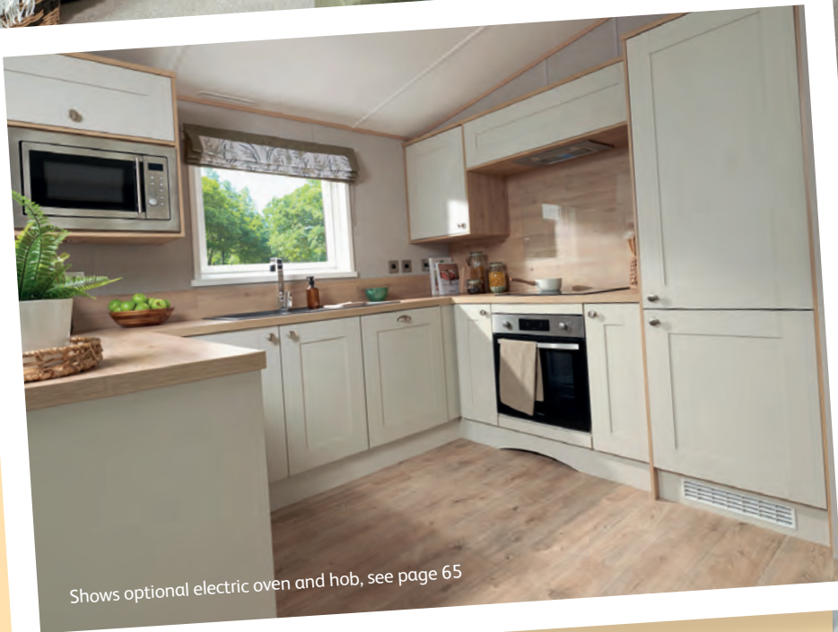
Shows optional electric oven and hob, see page 65