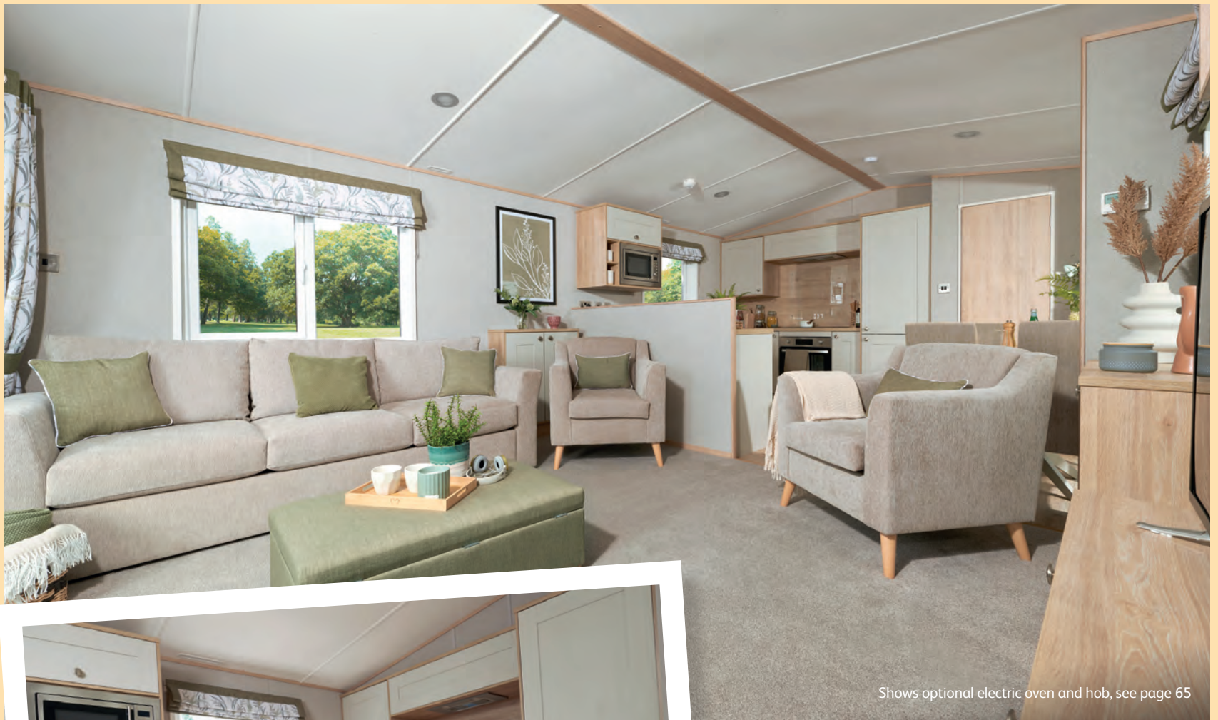
Shows optional electric oven and hob, see page 65